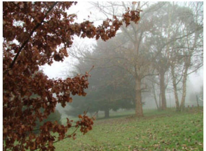
Morning Mist 23/07/04.

Early in the breeding season, few new arrivals occurred. Some Black Duck and Wood Duck with small numbers of young. However late in the season, November a couple of large families of Wood Duck and some Dusky moore hen appeared. The larger families survived better and so numbers are good. Also the return of three Little Griebs just recently. Keep your eye out for these on either Lake Nobelius or Treganowan.