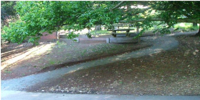
Path to the Kiosk Barbeque area.

Our suggestion of a path to the Kiosk Barbeque area was taken up by Management and a path made from the bottom to the top road. All nicely tamped down the path survived the rains and is a great improvement to the area. Good work guys! Also the path from Wattle Creek car park along the lake edge has been resurfaced, with an improvement here.