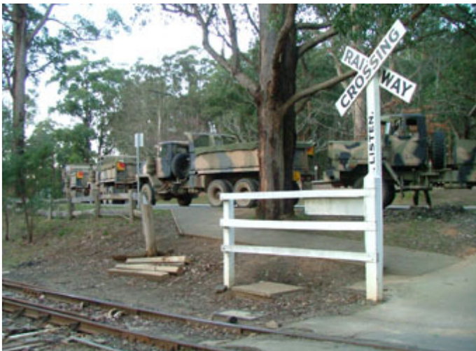
The Army visits Emerald Lake Park, 20/08/04"

A surprise invasion by some of our troupes training as heavy vehicle drivers occurred late on 20th August. It was quite a shock to see these monster vehicles fill the bus loop. They stayed late and enjoyed a barbecue tea before continuing in the dark. I guess there were a few surprises when they passed through our township also. Come again anytime boys! In the past the Australian Armed forces have been instrumental in building some of our infrastructure and trails. Unfortunately the signs acknowledging theirs and others contributions (Police Force etc.) have been demolished by vandals.