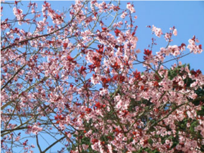
The first sign of Spring is the Prunus Blossom.